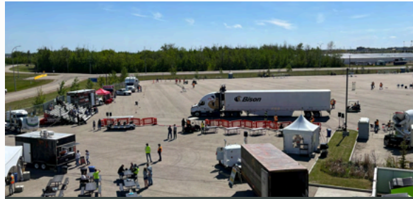
Professional Truck Driving Championship MAY 2026