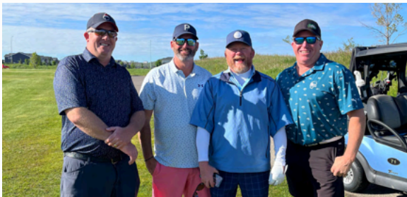
AMTA Annual Golf Tournaments JUNE 2026