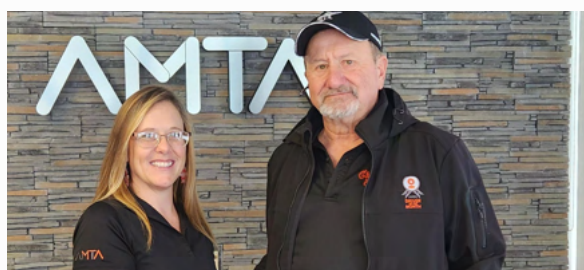
Driver of the Month JANUARY - DECEMBER 2026