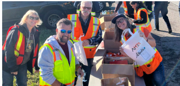
AMTA Driver Appreciation SEPTEMBER 2026