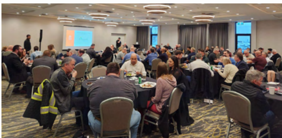
AMTA Regional Meetings JANUARY - DECEMBER 2026