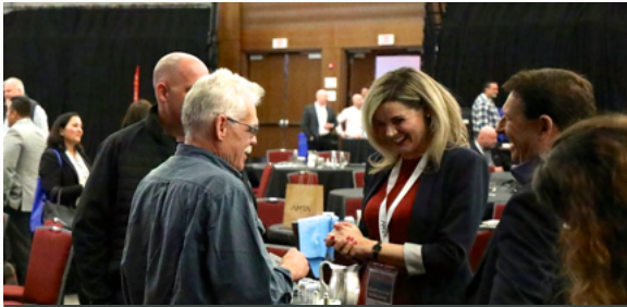
AMTA Annual Conference APRIL 22-23, 2026